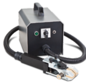
Portable wire butt welder to easily join wire ends from a used to a new pack

Prompt and easy access to product related documentation like CoC, 3.1, SDS, PDS, DoP, Approvals, etc. through a smartphone app.