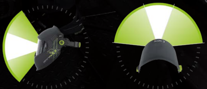
Comparing fields of view: standard ADF vs. optrel panoramaxx